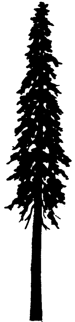
Abies amabilis - Pacific silver fir